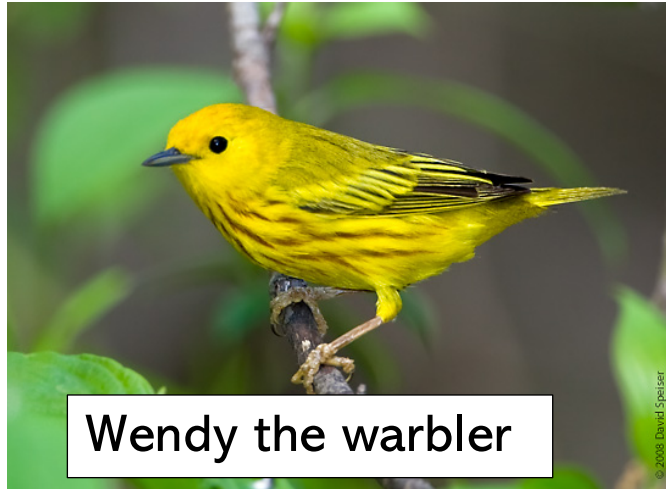
Wendy the warbler